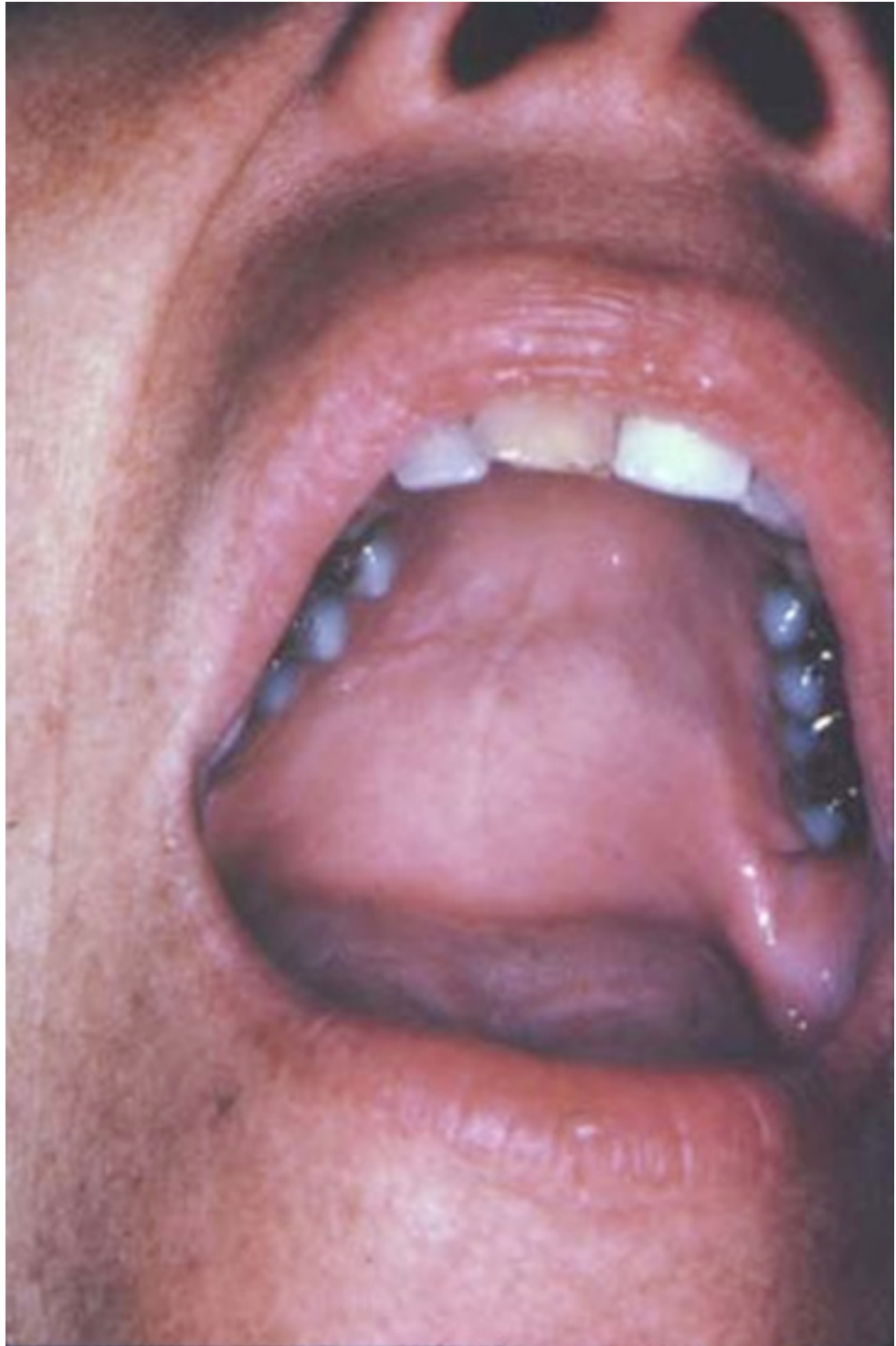
Media file 4: Nine weeks. Salivary gland infarction (same patient as in Media Files 1-3).