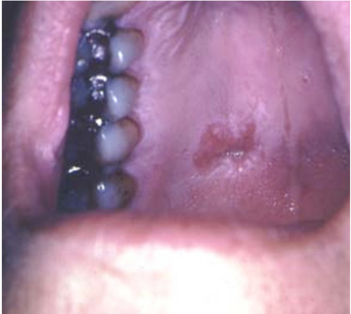
Media file 3: At 6 weeks (same patient as in Media Files 1, 2, and 4).