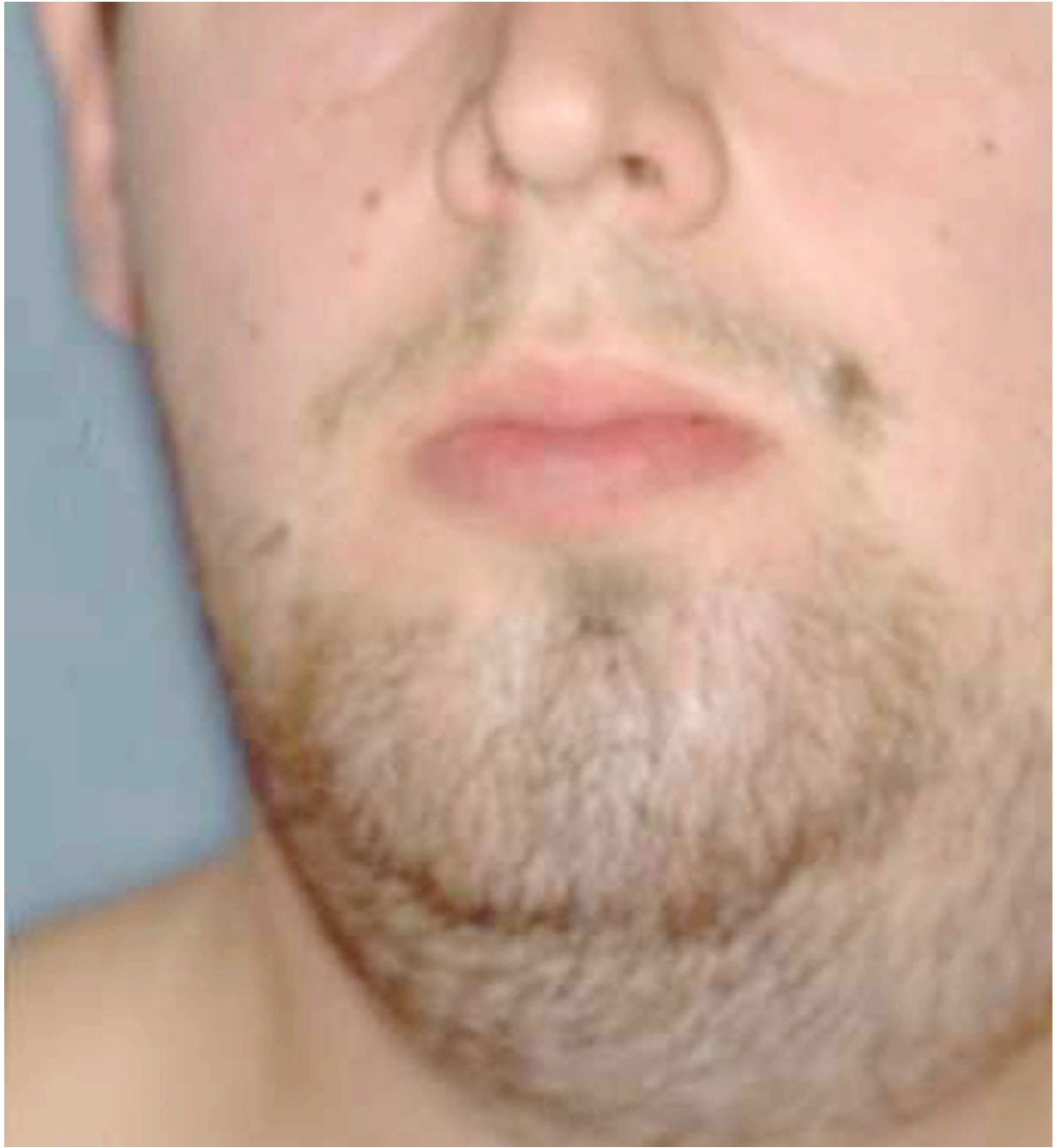
Media file 2: Note the significant left buccal and submandibular swelling.