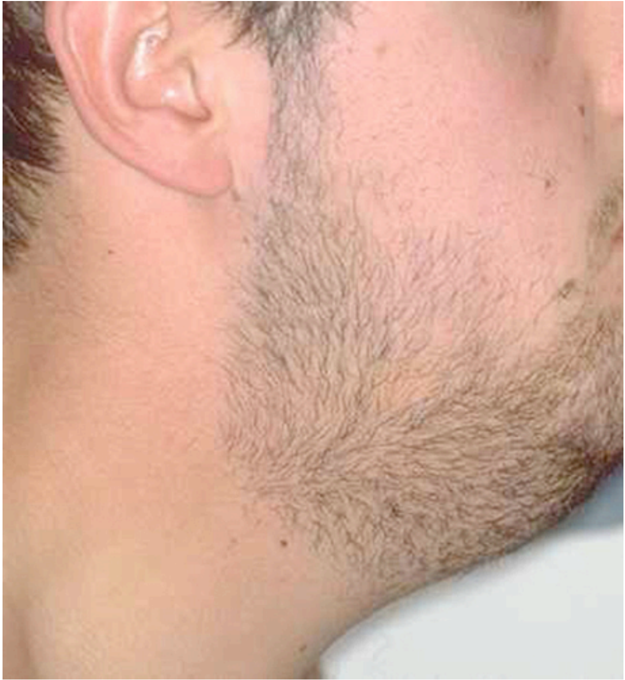
Media file 3: Profile view of a young adult with oral lymphangioma (same patient as in Media File 2).