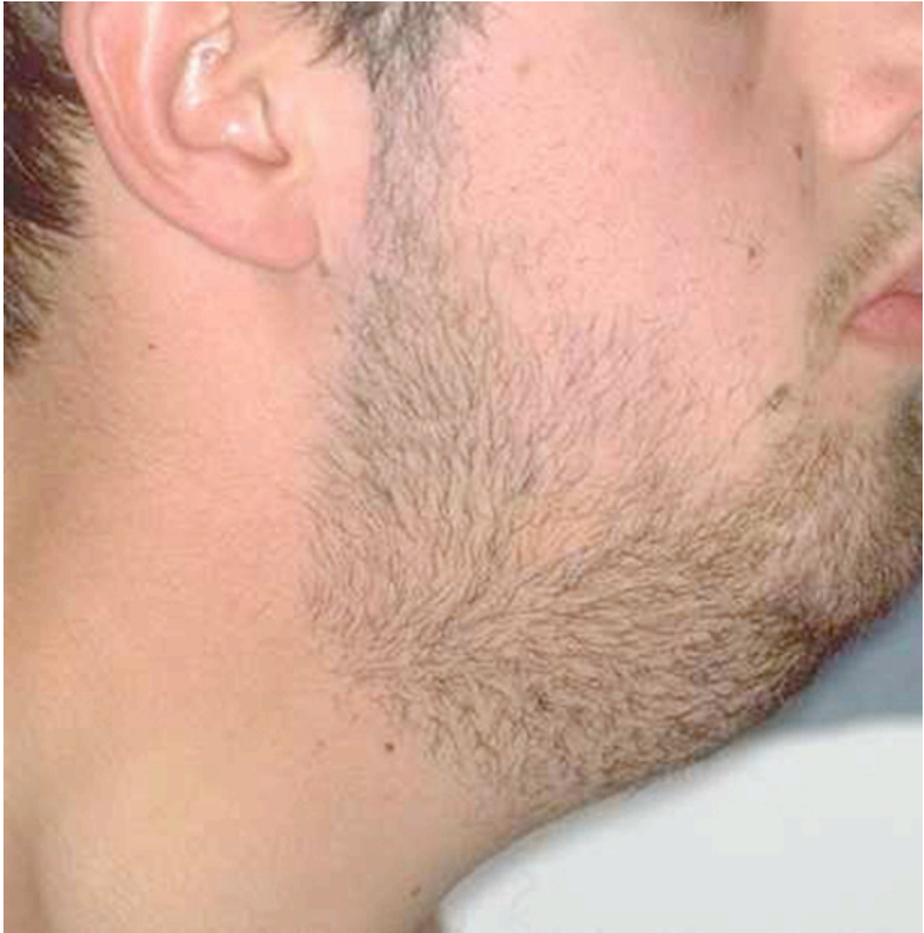
Profile view of a young adult with oral lymphangioma (same patient as in Media File 2).