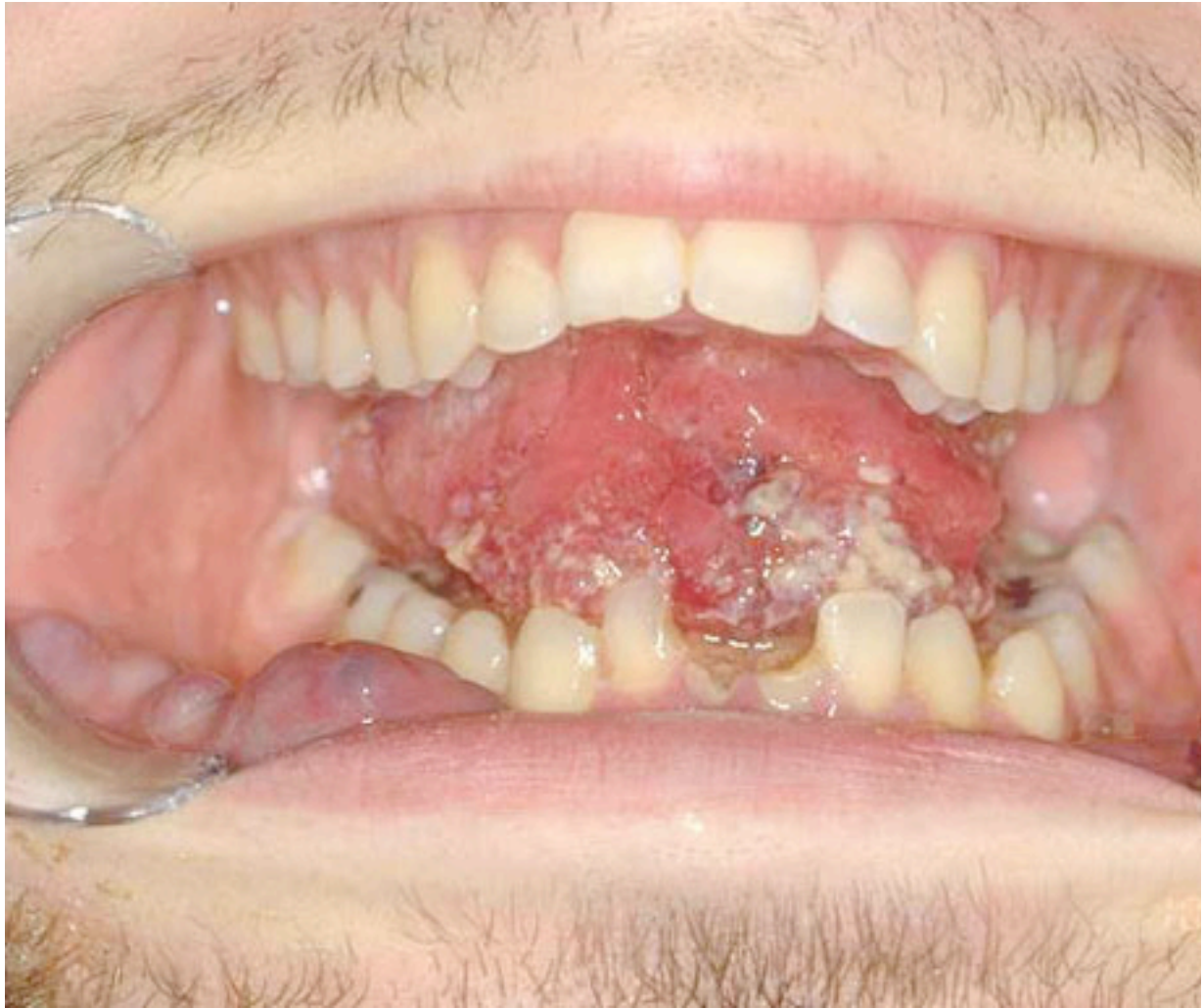
Media file 1: Marked lingual enlargement caused by lymphatic malformation. Note the pebbly surface in areas not covered by materia alba. Also note the ecchymotic lesions protruding from the buccal mucosa in the mandibular vestibules.